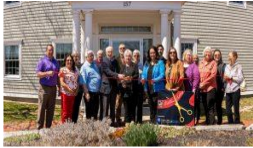
Ribbon Cutting New Location-Staff and Providers

157 Capitol Street, Suite #4 Augusta, Maine 04330 Phone: (207) 582-1960 Toll Free: 1-800-535-6555